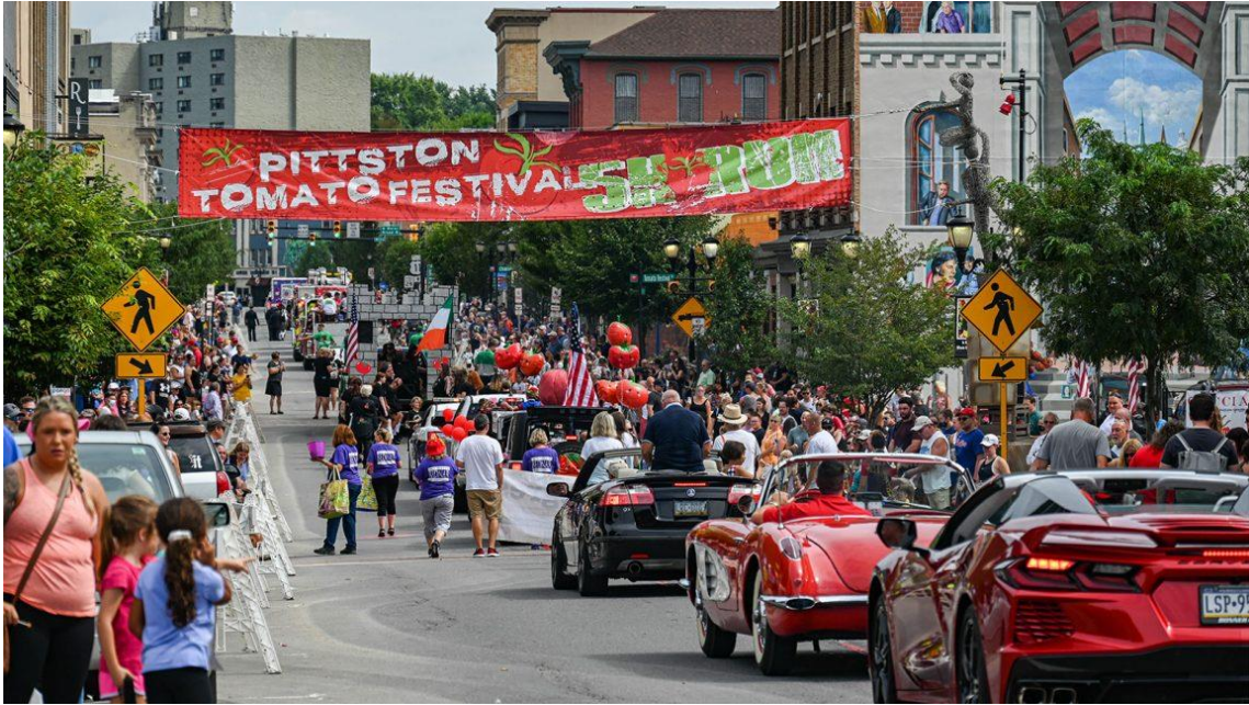
Pittston Tomato Festival Parade 2021

The 2022 Pittston Tomato Festival takes place from Thursday, August 18 through Sunday, August 21 at the Tomato Festival Grounds, South Main St., Pittston.