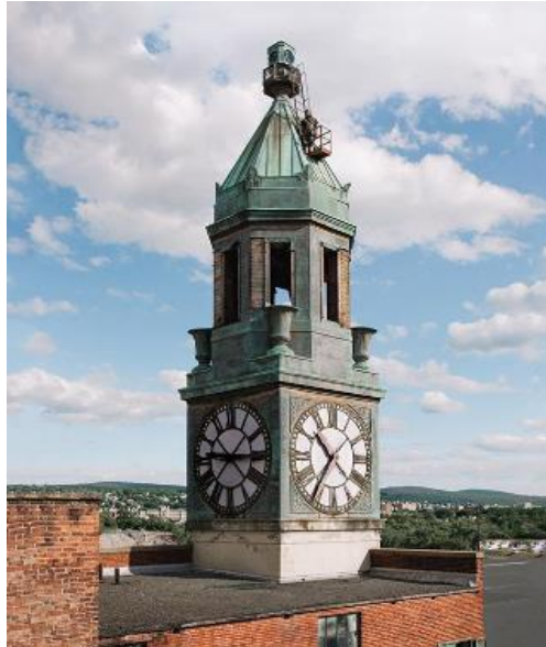
The Scranton Laceworks clock tower is home to an historic bell that was manufactured in 1927 by the famous Meenley Bell Foundry, West Troy, NY

Time and Lace: A History of the Scranton Lace Company exhibit will take place from September 2 through September 30 at the Hope Horn Gallery located on the University of Scranton campus.