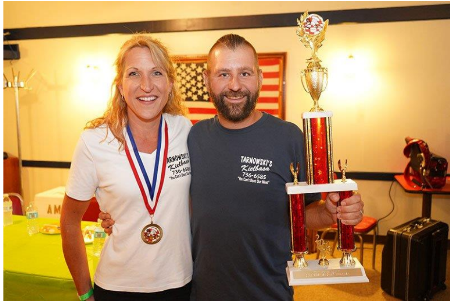
Tarnowski's Kielbasa, 2021 Winner, both fresh and smoked categories

The festival and contest have been a mainstay of regional summer festivals each year since 2004, except for 2020 when COVID-19 forced cancellation of the event.