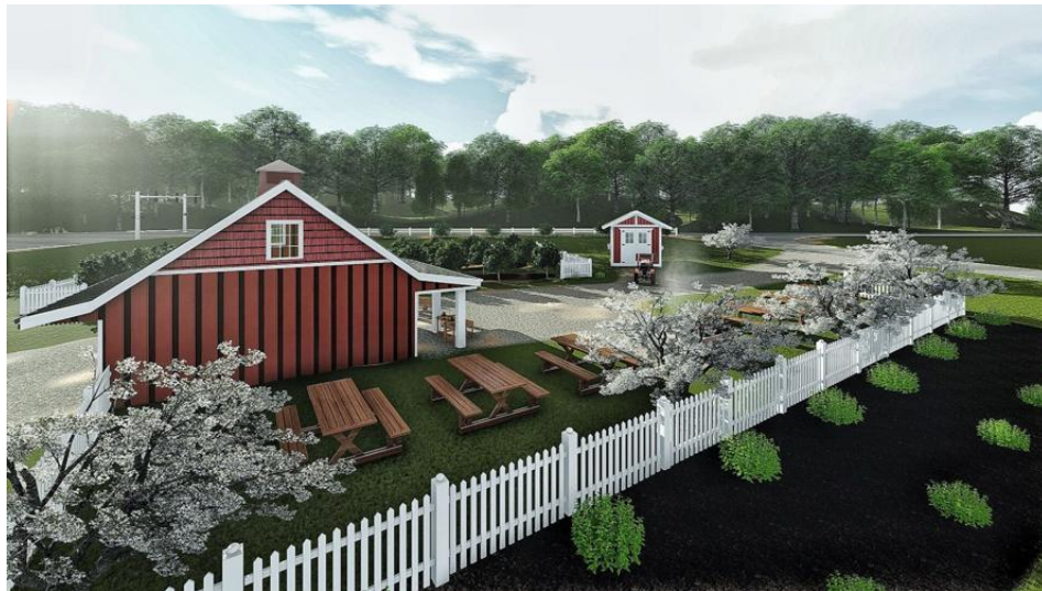
Artist's rendering of the proposed Mayfield Community Farmers Market

Earlier in 2022, the Borough of Mayfield and the NEET Center announced plans to construct a 1,200 sq. ft. indoor farmers' market at an estimated cost of between $200,000 and $300,000. Planners would like a non-profit group to operate the market.