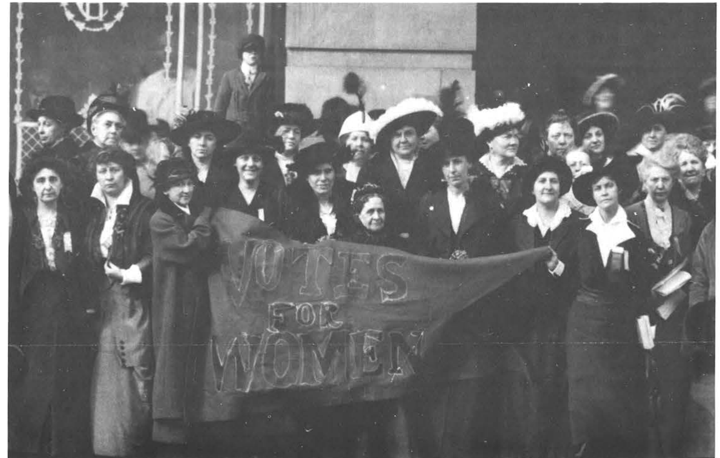
Detail: Women's Suffrage Convention, Hotel Casey, Scranton, Pennsylvania Courtesy of the Pennsylvania State Archives, undated